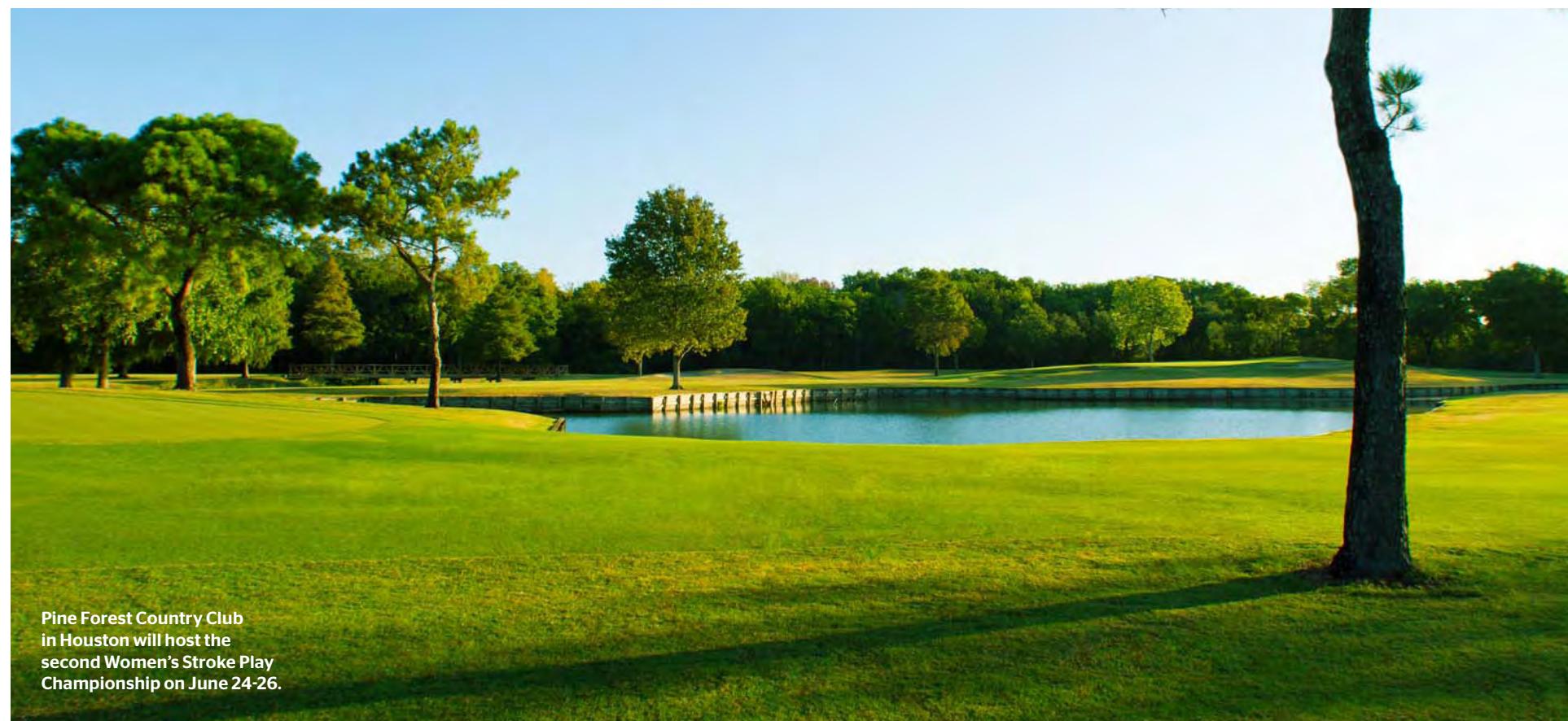
Pine Forest Country Club in Houston will host the second Women's Stroke Play Championship on June 24-26.

For more information regarding registration and deadlines, please click here .