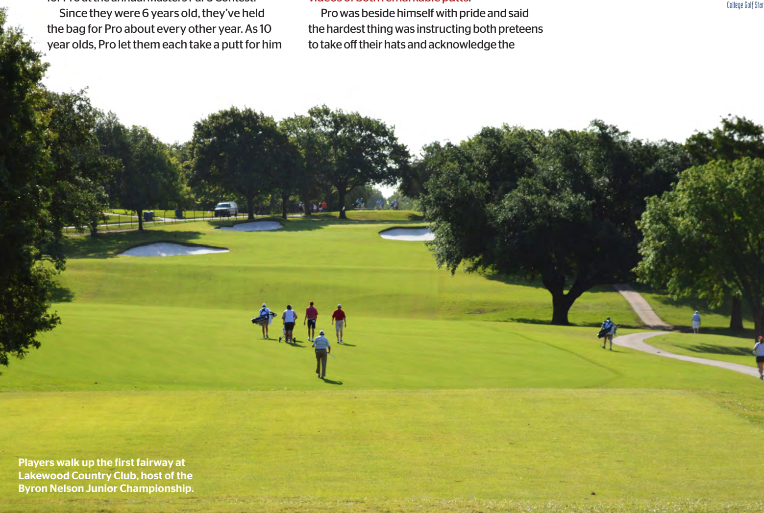
Players walk up the first fairway at Lakewood Country Club, host of the Byron Nelson Junior Championship.

Jan. 23-24 | Dallas Athletic Club | Dallas